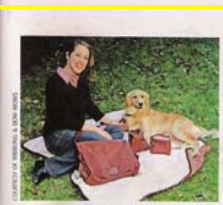
A single carry-all for pets and their parents makes a great gift.